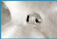
Numen/For Use "Tape Tokyo 02"

* Entrance fees are necessary to view the exhibition. * Up to two people can go inside the installation at the same time. * When there are long waiting lines, there may not be enough time before closing time for everyone to experience the work. * Numbered tickets may be given out in cases of overcrowding.