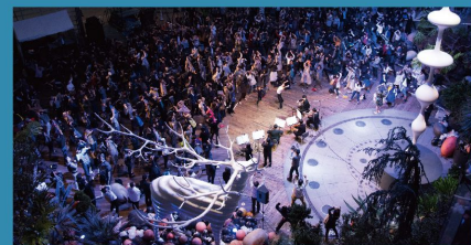
Radio Calisthenics in Live Classical Music! (2016)