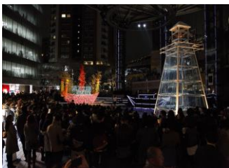
Katsuhiko Hibino 《TRIP→Project》

2013 830 thousand people 2014 700 thousand people 2015 780 thousand people 2016 630 thousand people