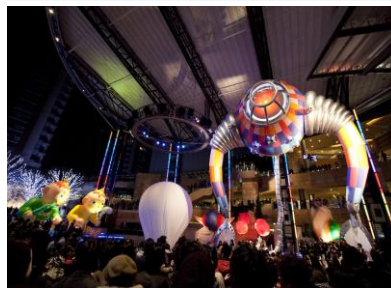
Noboru Tsubaki 《Before Flower》