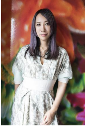
Main Program Artist ; Mika Ninagawa