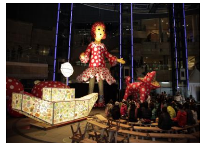
Yayoi Kusama 《Love Forever, The Future is Mine!》

2013 830 thousand people 2014 700 thousand people 2015 780 thousand people 2016 630 thousand people