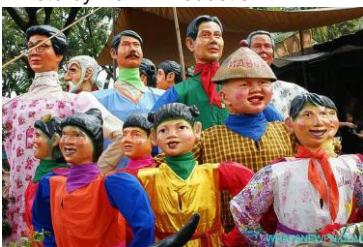
《Angono Higantes, Big and Small》