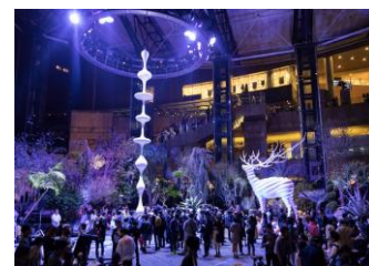
Kohei Nara/Seijun Nishihata/daisy Balloon Main Program

*The 2011 event was cancelled due to The Great East Japan Earthquake