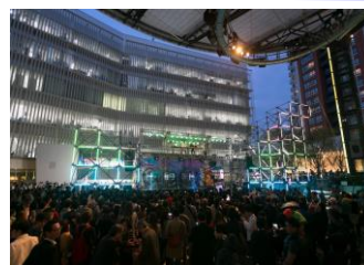
Seiichi Saito 《Art Truck Project "Hal" "Akebono"》