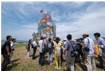
《OK Tower》 2016

Artists from Southeast Asia and Japanese are invited to work together with various people and communities of Roppongi. Through workshops and research of local history and cultural resources, the project aims to vitalize cultural activities as well as actualizing potential local content. Look forward to 'matsuri' themed art pieces by the local community and artists only at Roppongi Art Night 2017.